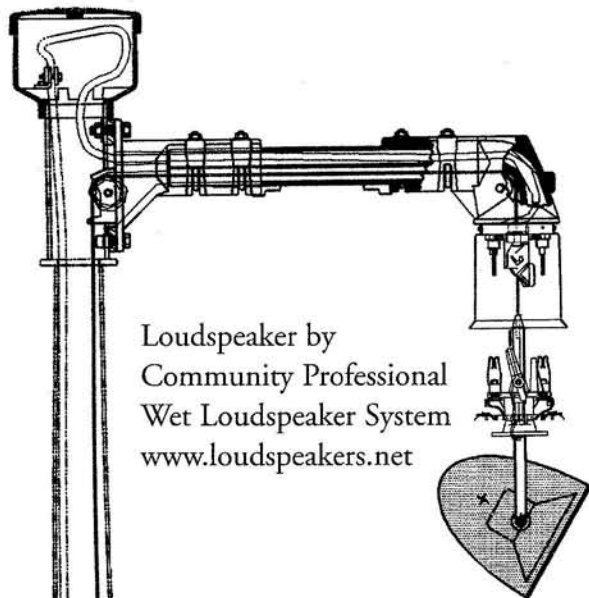
Frontal View of Speaker